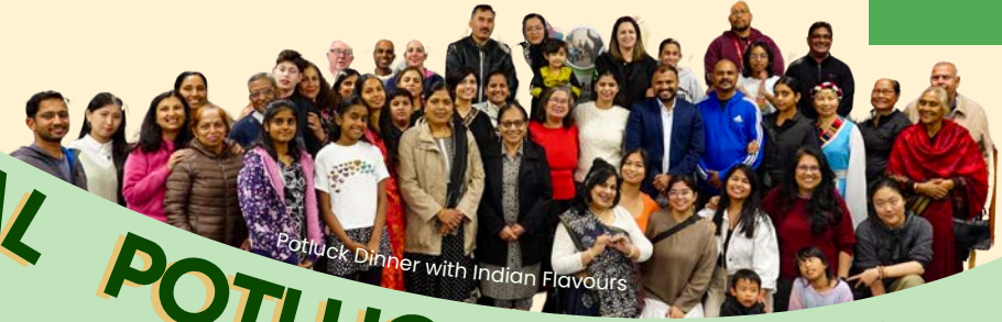
Potluck Dinner with Indian Flavours

A big thank you to everyone who participated and shared their dishes. Thank you to all who performed. The event was filled with a delightful variety of multicultural cuisines, making it truly special. Special thanks to all attendees, volunteers, and MMC staff for contributing to the success of this event!