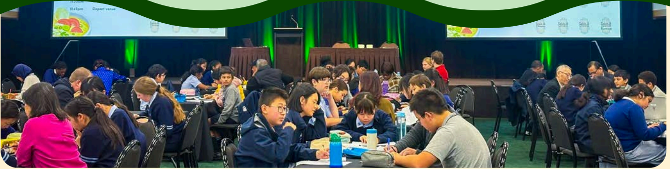
Palmerston North Intermediate School students and volunteer mentors during the workshop

First Voice is an annual event held by Palmerston North Intermediate Normal School (PNINS) for students whose first language is not English. PNINS has many students who are bilingual and even multilingual and during the First Voice event, students are given the opportunity to showcase written use of their first language. It has been proven that encouraging the active use of one's first language can have positive effects on the children's self-esteem, their relationships with their parents, their eventual proficiency in other languages, and their learning in general.