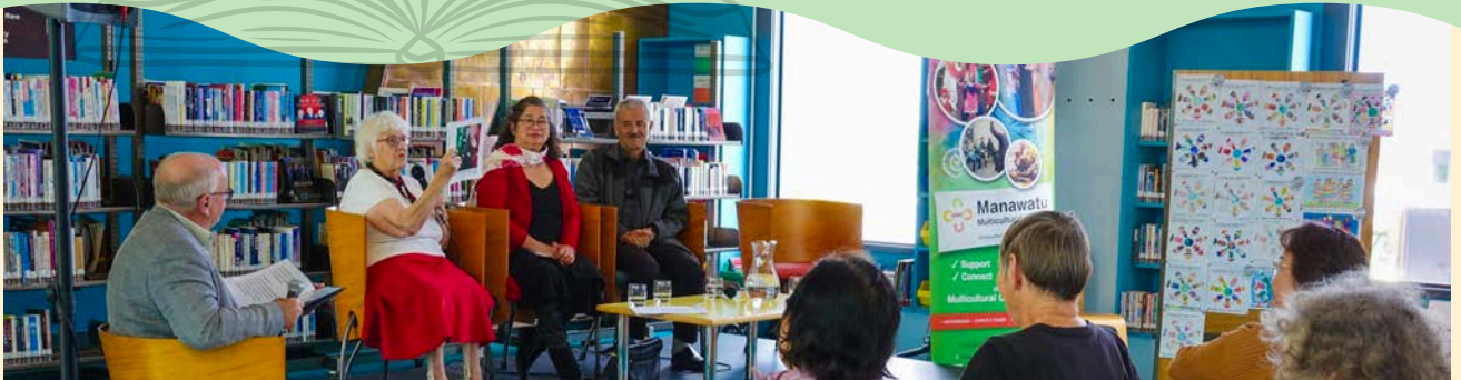
Panel discussion on various life stories