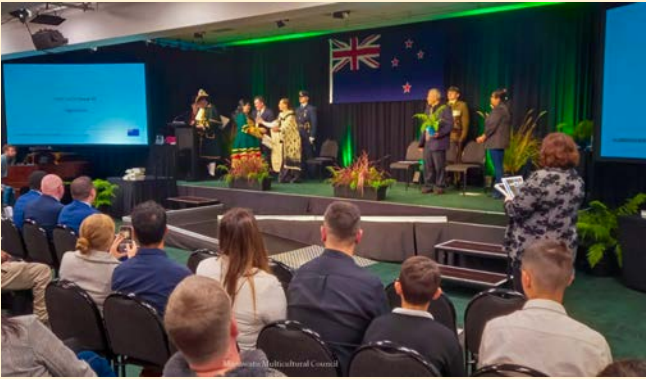
During the ceremony

In May, we celebrated the incredible journey of our newest citizens. Congratulations to these individuals as they begin this exciting new chapter. Our heartfelt thanks go out to everyone who played a part – from PNCC, MMC board members, and staff to volunteers, officials, and community members. The next ceremony will be on August.