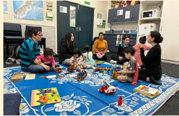
Kids activity together with the facilitator