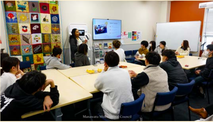
Japanese students during their visit