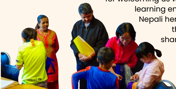
MMC staff giving out MMC merchandise to the students

We had an incredible time visiting the Nepali School on March. It was an enriching experience immersing ourselves in Nepali culture, language, and traditions. A big thank you to the Nepali School for welcoming us with open arms and for providing such a warm and inclusive learning environment. Your commitment to preserving and promoting Nepali heritage is truly commendable. We extend our gratitude to all the students, teachers, and staff for their hospitality and for sharing their knowledge and experiences with us. This visit was not only educational but also a celebration of cultural diversity and unity.