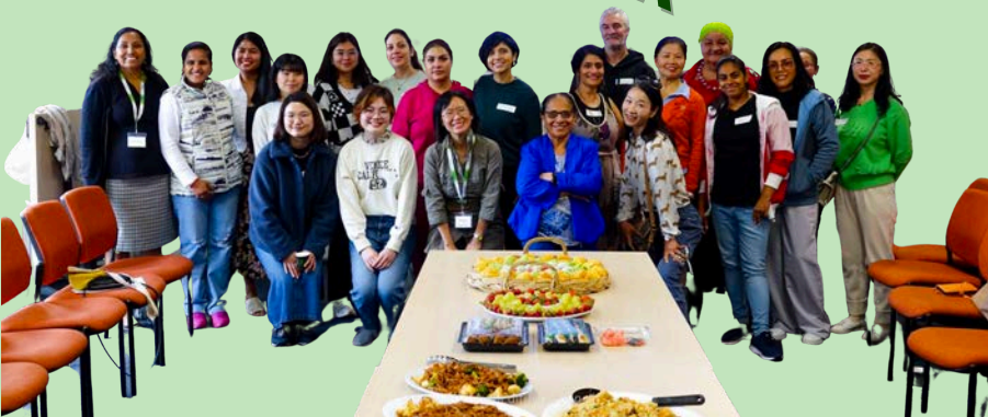
MMC Staff and Volunteers

In April, we honored our volunteers at the Volunteer Get Together event. We want to extend our heartfelt gratitude to everyone who attended, showcasing their dedication and hard work. The event was a fantastic celebration of your contributions and an opportunity to connect with other volunteers at MMC.