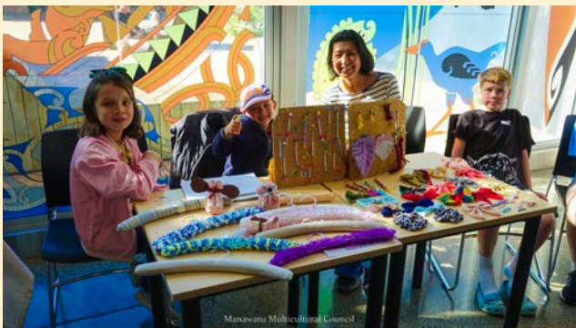
One of the stall holders at the kids market

MMC, in partnership with Global Parent Support, is thrilled to announce another successful Kids Market! Both organizations express sincere gratitude to the parents and children for their enthusiastic involvement. Witnessing all the smiling faces and vibrant creativity throughout the day was truly heartwarming. A big thank you to everyone who joined us and explored our market - we hope you enjoyed it as much as we did and discovered some amazing treasures crafted by the talented kids. We look forward to welcoming you back to the next Kids Market during the upcoming school holidays! Lastly, special thanks to Te Manawa Museum for their hospitality, collaboration, and assistance.