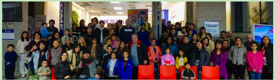
Potluck Dinner with Japanese Flavours