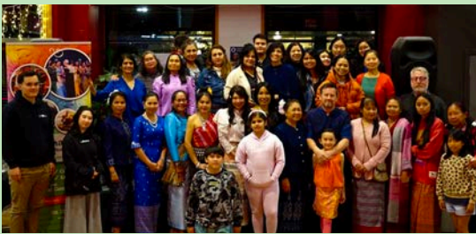
Potluck Dinner with Thai Flavours