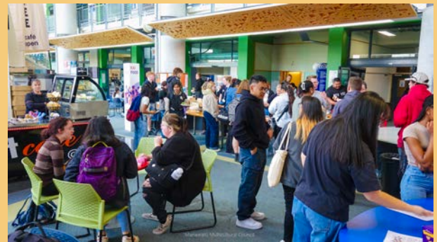
Students at UCOL during International day

Congratulations to UCOL Manawatū for a successful International Day! We had a lot of fun meeting their students and community. We were treated with some amazing cultural performances. Thank you to everyone who joined us!