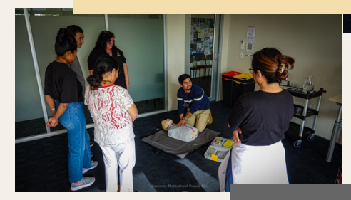
3 Steps for Life Workshop