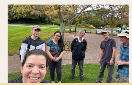
English Conversation at the park -Talk & Walk