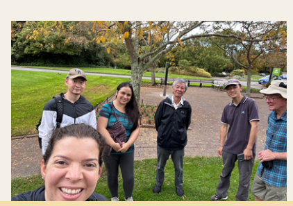
English Conversation at the park- Talk & Walk