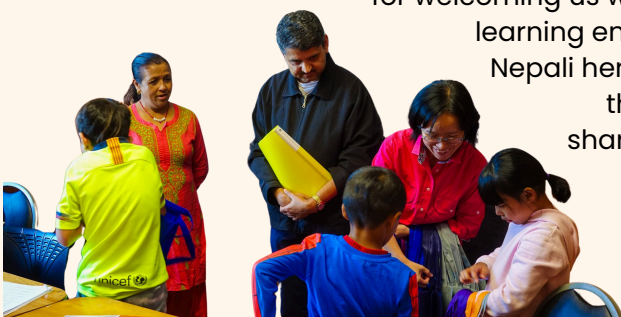
MMC staff giving MMC merchandise to the students

We had an incredible time visiting the Nepali School on March. It was an enriching experience immersing ourselves in Nepali culture, language, and traditions. A big thank you to the Nepali School for welcoming us with open arms and for providing such a warm and inclusive learning environment. Your commitment to preserving and promoting Nepali heritage is truly commendable. We extend our gratitude to all the students, teachers, and staff for their hospitality and for sharing their knowledge and experiences with us. This visit was not only educational but also a celebration of cultural diversity and unity.