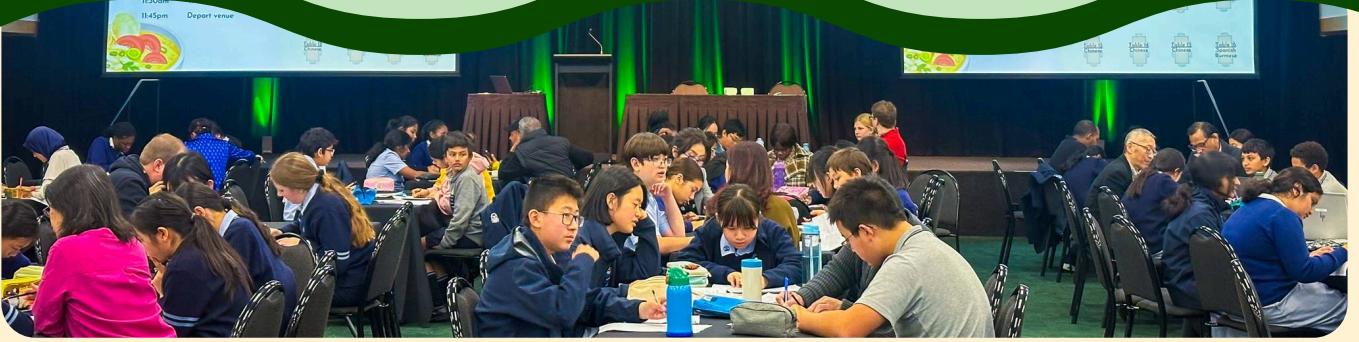
Palmerston North Intermediate School students and volunteer mentors during the workshop

First Voice is an annual event held by Palmerston North Intermediate Normal School (PNINS) for students whose first language is not English. PNINS has many students who are bilingual and even multilingual and during the First Voice event, students are given the opportunity to showcase written use of their first language. It has been proven that encouraging the active use of one's first language can have positive effects on the children's self-esteem, their relationships with their parents, their eventual proficiency in other languages, and their learning in general.