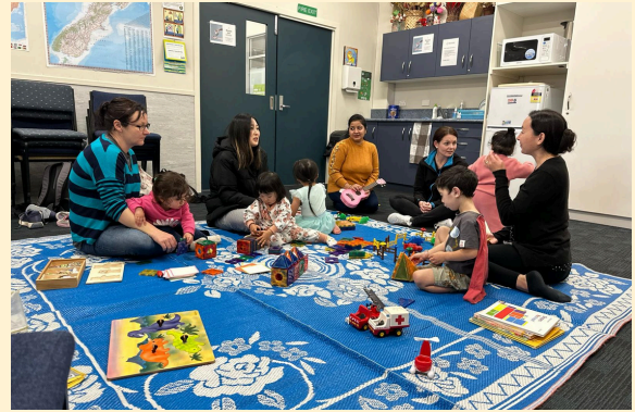
Kids activity together with the facilitator