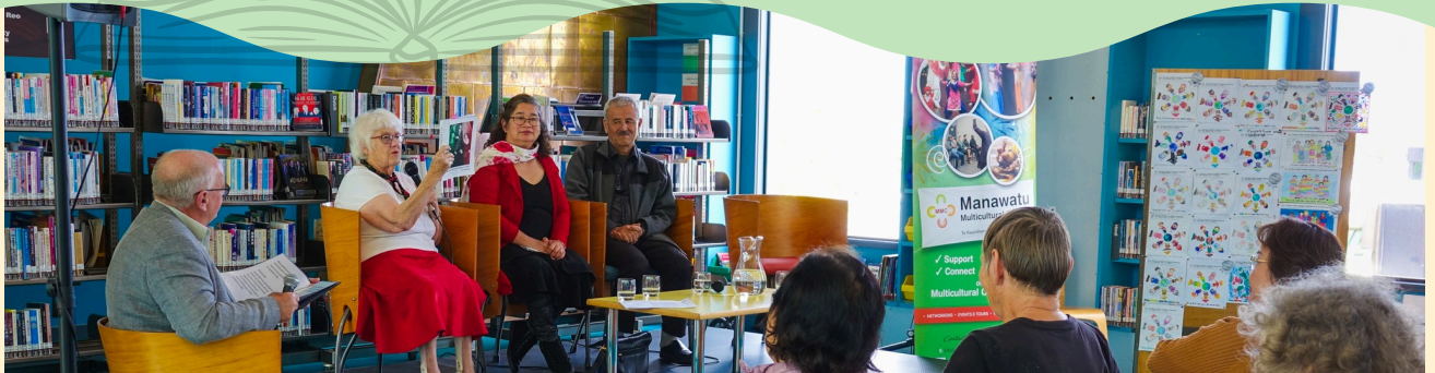
Panel discussion on various life stories