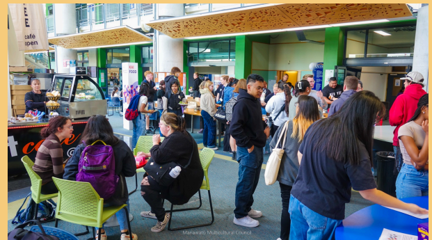
Students at UCOL during International day

Congratulations to UCOL Manawatū for a successful International Day! We had a lot of fun meeting their students and community. We were treated with some amazing cultural performances. Thank you to everyone who joined us!