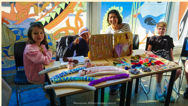
One of the stall holders at the kids market

MMC, in partnership with Global Parent Support, is thrilled to announce another successful Kids Market! Both organizations express sincere gratitude to the parents and children for their enthusiastic involvement. Witnessing all the smiling faces and vibrant creativity throughout the day was truly heartwarming. A big thank you to everyone who joined us and explored our market - we hope you enjoyed it as much as we did and discovered some amazing treasures crafted by the talented kids. We look forward to welcoming you back to the next Kids Market during the upcoming school holidays! Lastly, special thanks to Te Manawa Museum for their hospitality, collaboration, and assistance.