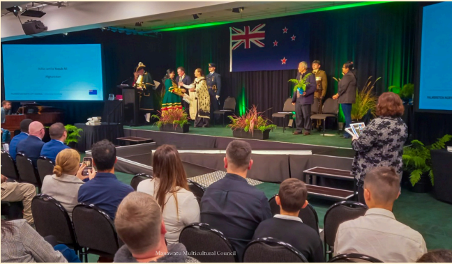
During the ceremony

In May, we celebrated the incredible journey of our newest citizens. Congratulations to these individuals as they begin this exciting new chapter. Our heartfelt thanks go out to everyone who played a part – from PNCC, MMC board members, and staff to volunteers, officials, and community members. The next ceremony will be on August.