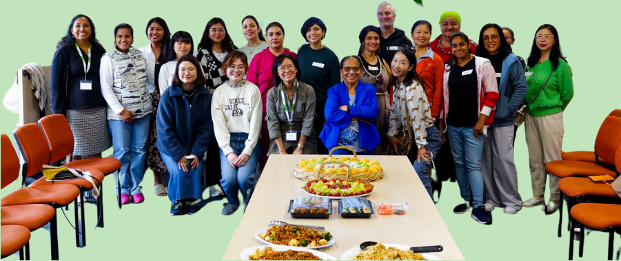
MMC Staff and Volunteers

In April, we honored our volunteers at the Volunteer Get Together event. We want to extend our heartfelt gratitude to everyone who attended, showcasing their dedication and hard work. The event was a fantastic celebration of your contributions and an opportunity to connect with other volunteers at MMC.