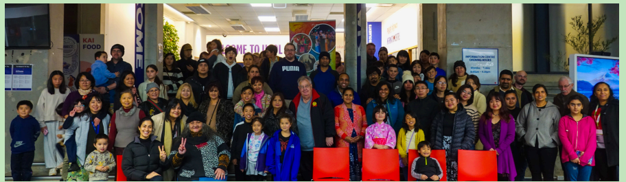
Potluck Dinner with Japanese Flavours