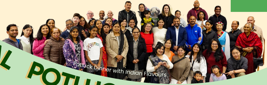
Potluck Dinner with Indian Flavours

A big thank you to everyone who participated and shared their dishes. Thank you to all who performed. The event was filled with a delightful variety of multicultural cuisines, making it truly special. Special thanks to all attendees, volunteers, and MMC staff for contributing to the success of this event!