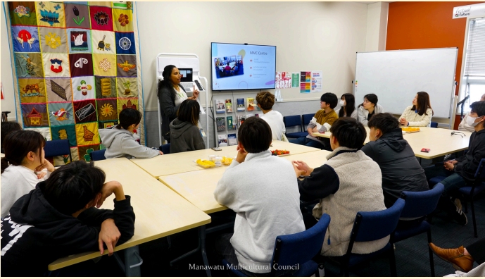
Japanese students during their visit