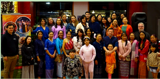
Potluck Dinner with Thai Flavours