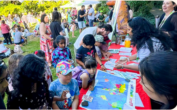
Children participating in activities at the MMC stall

MMC had the privilege of participating in the Summer Reading Programme organised by the Palmerston North City Library. We extend our heartfelt congratulations to all the children who actively engaged in the programme, making it a highly productive day filled with literacy and fun for the whole family. Our stall featured various activities and games, thanks to the dedication of our staff and volunteers. Let's continue promoting a love for reading in our community together!