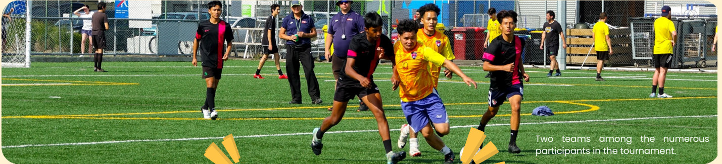
Two teams among the numerous participants in the tournament.