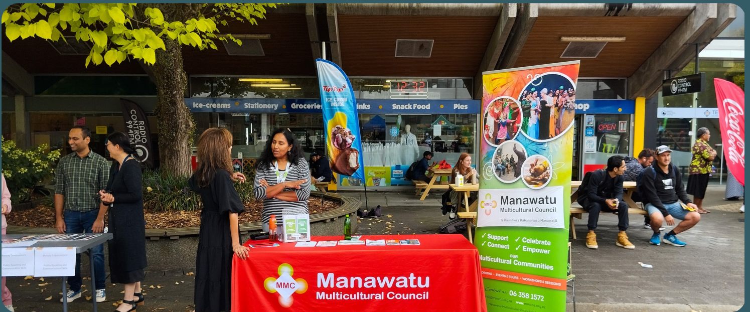
MMC Stall at the Massey carnival

Besides our UCOL stall, we also represented MMC during Massey University's orientation day! We had the pleasure of connecting with numerous new students and introduce them to MMC's range of services to communities. A heartfelt thank you to everyone who stopped by and showed their genuine interest in learning more about the cultural diversity in Palmerston North.