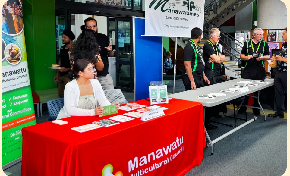
MMC Stall at the UCOL Community Connect

A heartfelt thank you to all who visited our Manawatu Multicultural Council's stall at the UCOL Community Connect event! It was truly wonderful to meet so many new faces and engage in conversations about our many communities. Let's continue to celebrate our differences and build a more inclusive and welcoming environment for all.