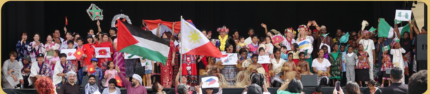
Various ethnic community groups participated in the Cultural Dress Parade.

On February 24, 2024, Palmy was transformed into a vibrant global cultural bazaar during the World Food, Craft, and Music Fair from 10 am to 5 pm. Visitors had the chance to savor a wide range of culinary delights and admire crafts from various parts of the world, creating an enriching cultural experience. The event was made even more special with a diverse selection of music and dance performances, catering to the enjoyment of all attendees. A big thank you to everyone involved in making this event a success.