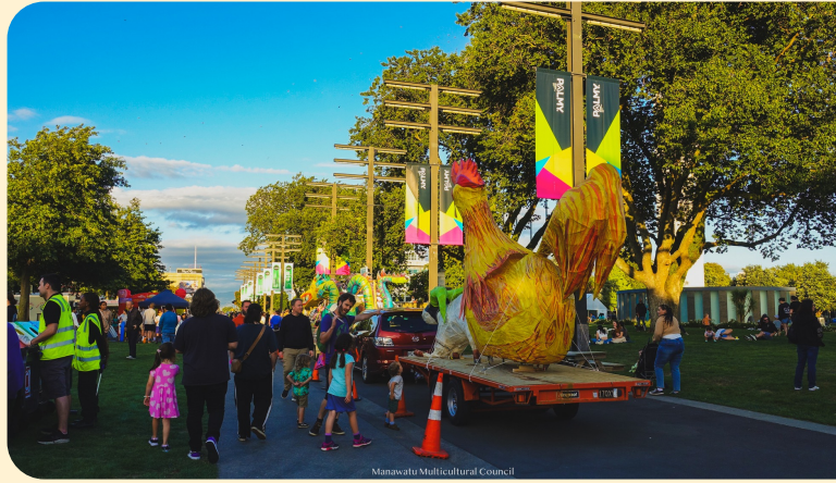
One of the lanterns in the parade.