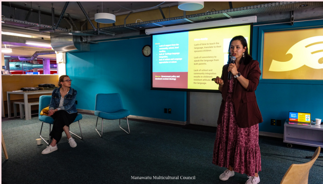
The speakers on the day