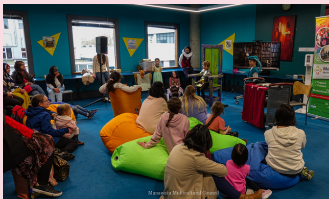
Visitors at one of language booth exhibitors (left) and kids' performance (right) at PN city library

MMC, PN City Library, and DIA hosted the Language Expo, a celebration of diversity and cultural exchange, on September 30th. The event showcased the cultural richness of diversity through numerous activities and provided an interactive way to learn about different languages spoken in Palmerston North. The Language Expo brought people together to connect and learn from each other, creating a unique opportunity for cultural exchange. The organizers extend their appreciation to all participants and contributors to the event's success.