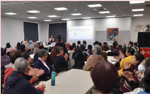
ethnic groups participated in the workshop

The Happy Woman Workshop was a collaborative effort between the Manawatu Multicultural Council, Arcs, Parentline, Think Hauora, Main and Women's Refuge. This unique workshop aimed to empower women from diverse backgrounds and help them lead fulfilling lives. Through a series of interactive sessions and activities, participants learnt valuable skills for personal and professional development. Topics covered included self-care, stress management, communication, goal setting, and more. The workshop provided a safe and supportive environment where women could connect, share experiences, and learn from each other.