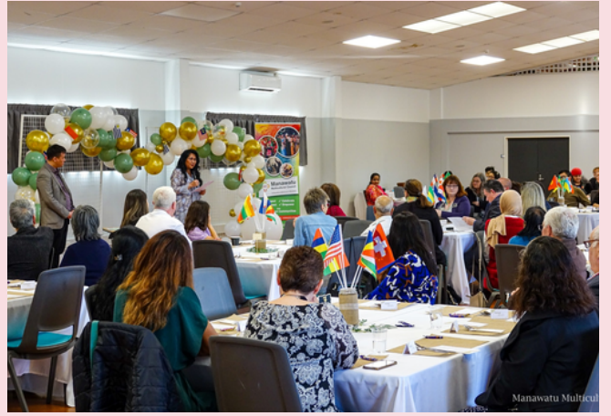
Speech by MMC president

We would like to thank the catering team for their excellent food, the dedicated volunteers who offered their assistance, and the broader ethnic communities for joining us. It was an honor to recognize and celebrate the Community Members, volunteers, and student interns during the event.