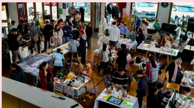
Stall holders in kids market day

Thank you to everyone who made our kids' market day a success. Your unwavering support to our little vendors and the event is highly appreciated. A special shoutout to Youth Space for providing us with the venue, the kids and parents who put up stalls and participated, and Global Parent Support for collaborating with us. Stay tuned to our Facebook page for more upcoming events.