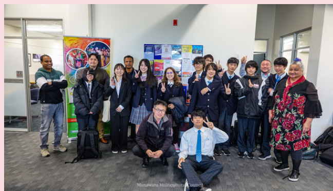
Group photo with Japanese students from IPU