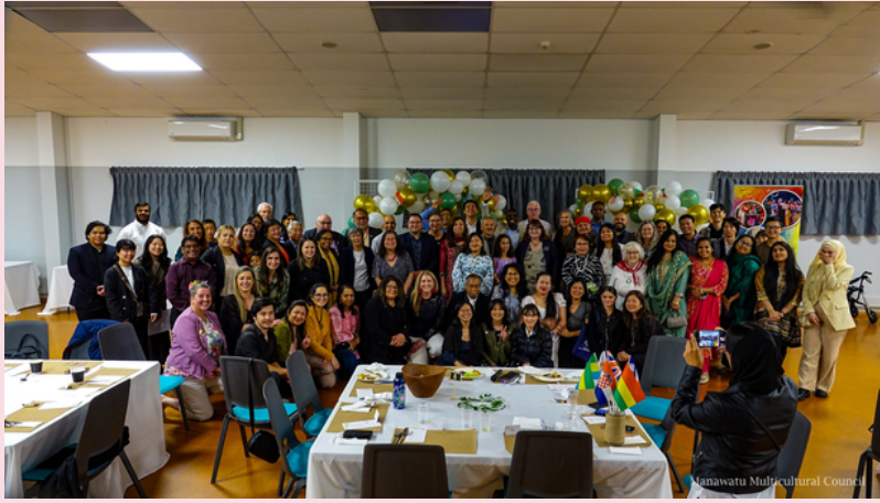
Group photo with all attendees during MMC annual dinner 2023