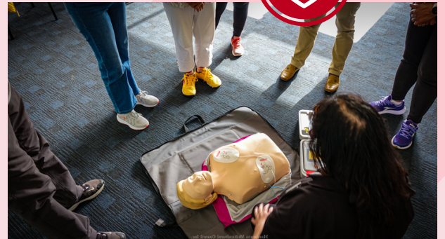
Demo performed by the facilitator

We extend our gratitude to St. John for their collaboration in facilitating this workshop, which provided individuals with the knowledge and proficiency to perform CPR. Acquiring this new skillset not only instills confidence and preparedness in emergency situations but also equips us to potentially save lives and make a positive impact in our community. This workshop is invaluable in empowering individuals with life-saving abilities.