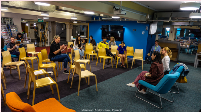
People who attended the workshop with Q&A