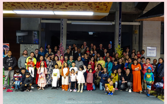
Group photo with Ethnic Community

On the 27th of October, we were joined by the Vietnam Community, who beautifully showcased their culture through music, dance, arts, crafts and of course, food. We would like to thank Palmy Vietnamese Association - PVA for their collaboration and effort, including the performers and everyone else involved. Thank you also to everyone who came along and brought a dish to share, our volunteers and staff who organized and assisted with the event preparation, and lastly to UCOL Te Pūkenga Manawātū for providing us with the venue and cooperating with us to make the event a success.