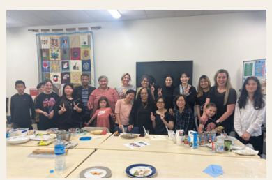
Cooking Workshop with Global Parents Support