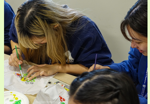
Art work activities during MMC visit

We welcome a group of Japanese high school students on a short course at Massey University on 27th of September. During their visit, we had the pleasure of introducing the students to the work we do and sharing our experiences with them.