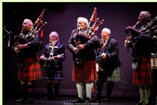
Various performances during the MMC's World on Stage 2023: singing (choir), dancing, drama, and music