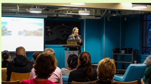
Welcoming School Programme report launch PN 2023