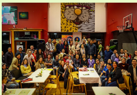
Potluck Dinner Middle Eastern Flavours