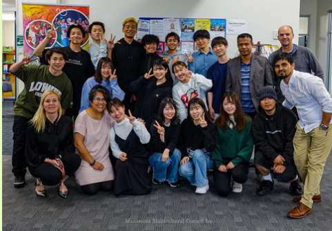
International students from Massey University in Palmerston North with MMC staffs.

Our team was thrilled to welcome the International students from Massey University and to introduce services provided by the MMC. We had a chance to interact with the students and learn about their cultures, backgrounds, and aspirations. It was a delightful experience to see how they embraced the local culture.