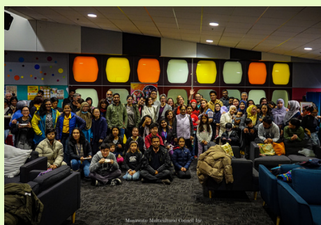
Potluck Dinner Malaysian & Indonesian Flavours