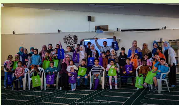
Group photo with all language programme participants

MMC host monthly cooking demo where volunteers prepare dishes from their respective cultures and bring them to the Centre for everyone to try. This is an excellent chance to promote cultural diversity through food sharing while meeting new people and forming connections. If you're interested in presenting a dish from your culture, please contact us 06 358 1572 or email admin@mmcnz.org.nz .