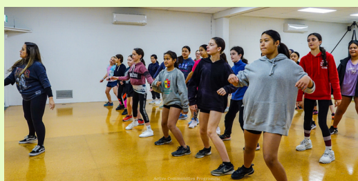
Dance activities with participants

We want to thank Sport Manawatū, Niuvaka Trust, and Bestcare Whakapai for their collaboration in organising a successful event. The coaches, volunteers, and extended team are also thanked for their hard work in making the event run smoothly. Thank you to all the parents and children for their enthusiastic participation in the programme. Thank you the Massey University Rec Centre for providing a great venue and support throughout the programme, making it a positive and impactful experience for everyone involved.