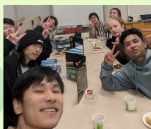
PN board game night

On 19th of August, MMC hosted a Board Game Night for the youth of Palmerston North. The programme aimed to foster a sense of community among the diverse participants hailing from different places, speaking different languages, and embracing different cultures. The event was a resounding success, with attendees enjoying a fun-filled evening of cross-cultural bonding. The accompanying photo serves as proof that board games can break down language barriers and bring people together. MMC is committed to continuing this initiative as part of its broader mission to promote cultural diversity in the Manawatū community.