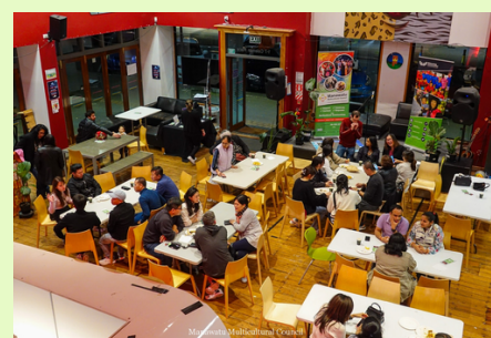
Potluck Dinner "A Taste of Home"

In September, MMC & PNCC hosted Potluck Dinner as a celebration of welcoming community week with "a taste of home" theme at Youth Space. We are grateful for the venue vendors and participants for sharing kai . Stay tuned for more information on our Facebook page about monthly potluck dinner. We hope to see you all next time!