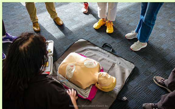
CPR demonstration by instructor

The CPR workshop conducted by St. John was an exceptional opportunity for individuals to gain the knowledge and ability to perform CPR. With this new skill, not only can we feel more confident and prepared in emergency situations, but we can also potentially save lives and make a positive impact in our community. It is such a valuable workshop that can empower people with life-saving skills!