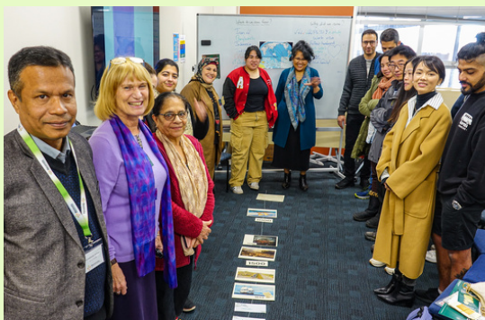
Group photo with workshop participants (left) and workshop activities (right)