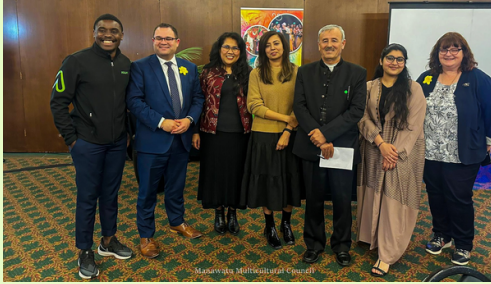
Group photo with annual general meeting attendees