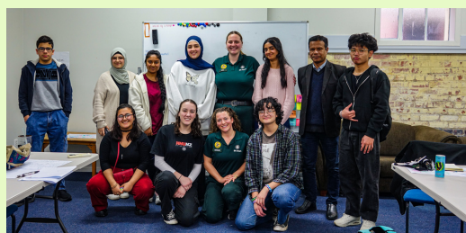
Group photos with participants

MMC in collaboration with St John present "Poipioa te Pitomata" programme (Harnessing Potential) to our youths. Programme for this year focuses on Empowering Youths and designed to help young people develop skills in self-determination, first aid, and overall wellness. This program aims to enhance confidence and encourage positive steps towards their future for all rangatahi involved. We extend our gratitude to St. John and Kings Grace Church for their contributions and support in making this programme possible. Special thanks to all of the rangatahi who participated.