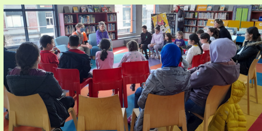
Book Buds and Palmerston North City Library

We're excited to announce the successful completion of our Book Buds journey with the PN City Library, and we couldn't have done it without the amazing librarians who took the time to engage with the children on their reading selections. Congratulations to the parents and children who completed our Book Buds programme this year – keep up the passion for reading! A special thank you to the team at PN City Library for their unwavering support and collaborative efforts throughout this journey.