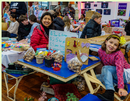
Mom & daughter were selling handmade earrings and bags of walnuts.

We want to extend our heartfelt gratitude to all the participants for their hard work in setting up their stalls, and for their cooperation during the event. We also want to thank everyone who came to support the kids- it means a lot to us. Last but not least, we would like to express our appreciation to Youth Space for generously letting us use their venue.