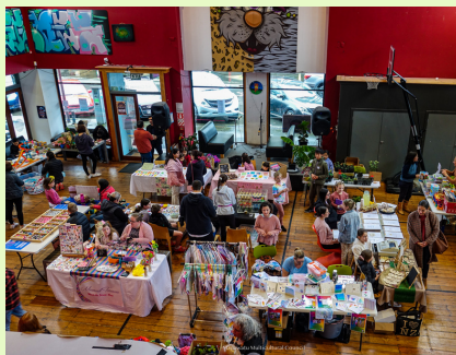
Children had a fun experience selling various types of goods.