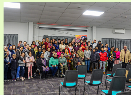
Potluck dinner Bangladesh & West Bengal flavours

Potluck Dinner is always a hit! We have Indonesian and Malaysian theme in May hosted by Manawatu Malaysian Society, Community Indonesian Manawatu (PREMIUM) & PPI Palmerston North. June's Potluck Dinner was hosted by the Middle Eastern Communities. Manawatu Bengalee Society hosted July's Potluck Dinner at the Community Leisure Centre.