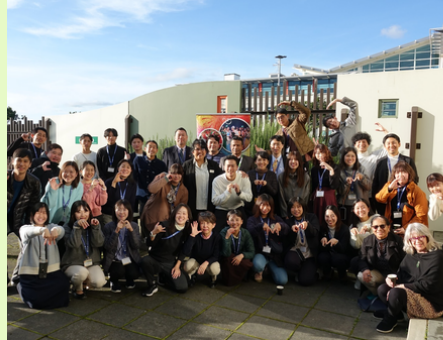
Japanese Teachers visit at MMC

On the 4th of August, MMC had the privilege of hosting 33 Japanese English teachers from Massey University. Our team was thrilled to have the opportunity to exchange knowledge and expertise, and help the teachers develop their global competence. The visit became a valuable cross-cultural learning experience for all involved.