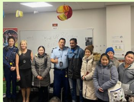
Group photo with facilitators and participants