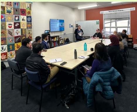
IRD workshop session at MMC

At MMC, we believe in empowering our community members by providing them with access to important resources and information. We were delighted to host the Inland Revenue Department's workshop on the 13th of July, which focused on addressing IRD-related issues. The workshop was well-attended by members of our ethnic community, who took away valuable insights and information from the event. We extend our heartfelt gratitude to the IRD for partnering with us and making this workshop possible. We look forward to continuing to collaborate with organizations like the IRD to empower our community members and make a positive impact in our community.