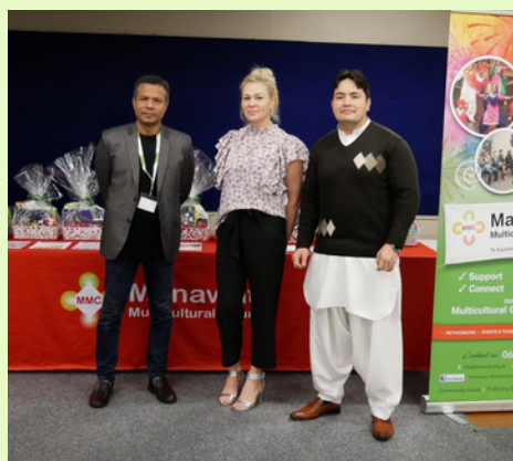
Raffle draw by MMC president and manager (left) and MMC manager and community connectors (right)

20th of June is commemorated as World Refugee Day to pay tribute to refugees worldwide. This day acknowledges the bravery and resilience of individuals who have been compelled to leave their homeland due to conflict or persecution. The MRRF event on 24th of June was another resounding success, and MMC played a key role.