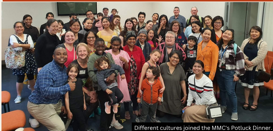
Different cultures joined the MMC's Potluck Dinner.