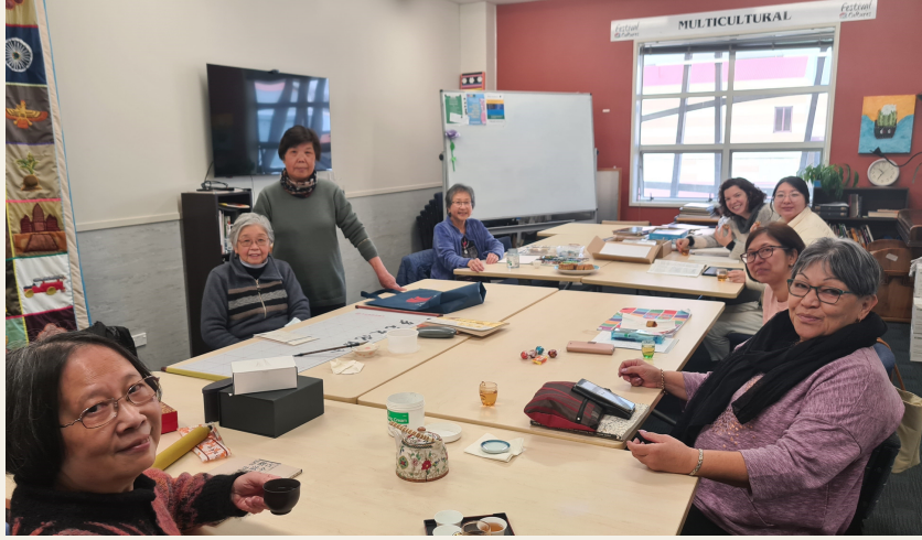
MMC's staff, students, and visitors enjoying the food

Cooking demonstration is one of MMC's monthly activity. It happens any Friday of the month. The host showcases a dish from their own country, demonstrate the procedure and advise where to buy the ingredients here in New Zealand.