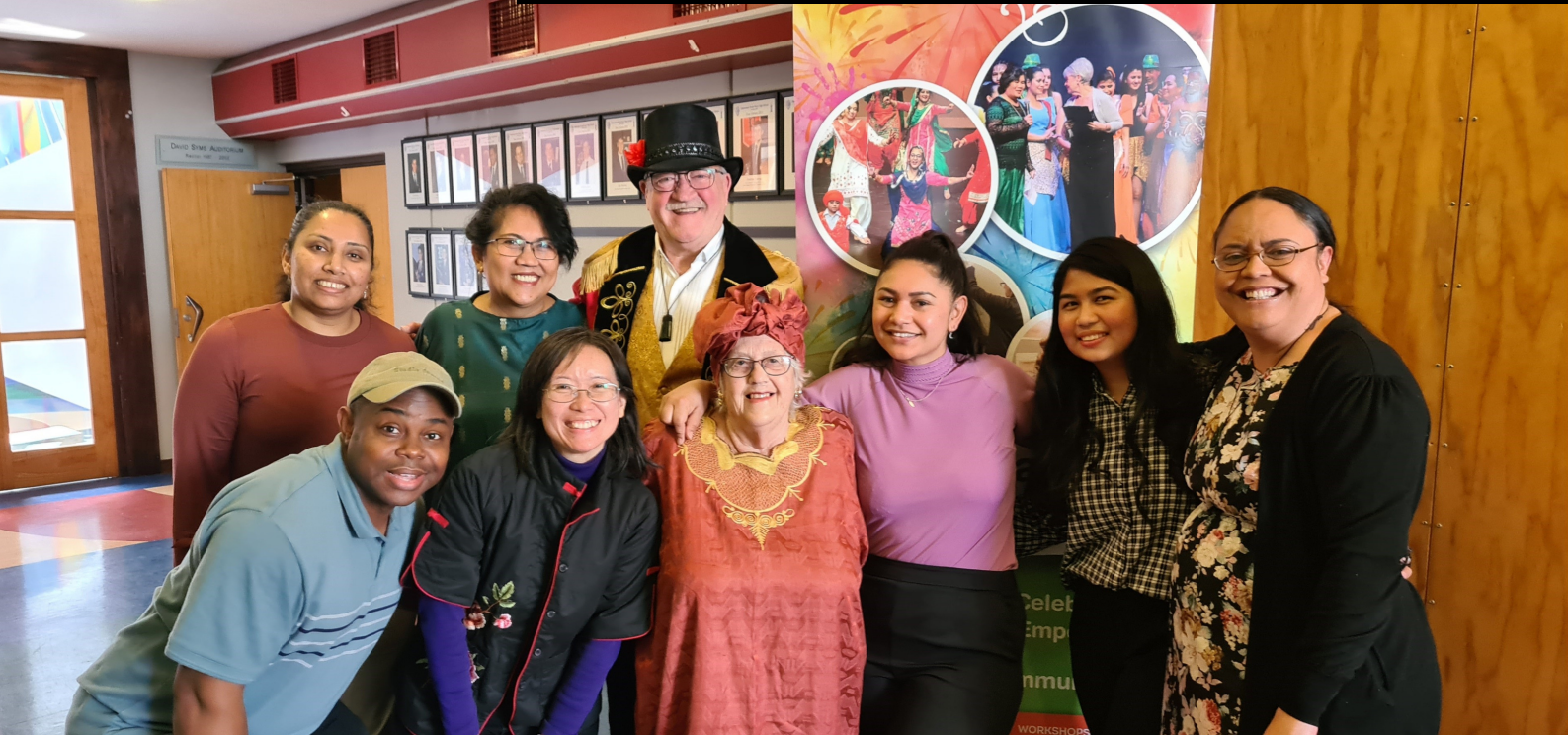
Some members of the organising team for Songs and Praises 2022

Wishing you all a safe and happy holiday season.