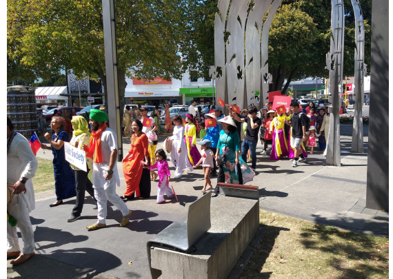
Festival of Cultures Parade

There have been monthly potluck dinners, the last one at MASH Trust involving the Sri Lankan community. Behind the scenes MMC has been developing projects to support our multicultural community. We look forward to some new developments in the next few months.