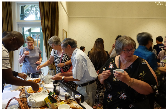
Teas & Coffees of the World