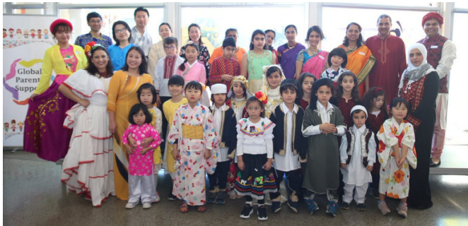
Cultural costume presentation participants

The event started with a fantastic choral performance from the Unity Singers, then continued with stage presentations of cultural costumes from 9 groups - Indian, Ukrainian, Libyan, Palestinian, Korean, Sri Lankan, Fijian, Vietnamese and Japanese. It was a fantastic time for families and kids who had fun with various games and activities and a nice ending to the school holidays!