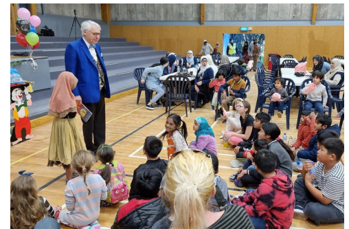
Some activities at EID Festival, captured by Lorna Johnson, Palmerston North city councillor