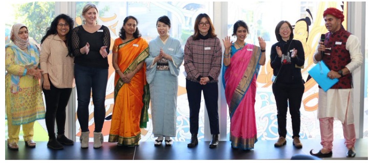
Global Parents Support committee members