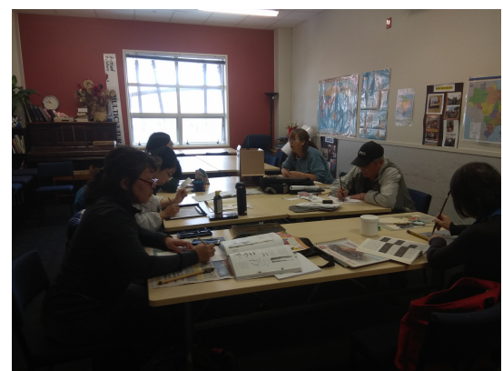
English Conversation Class