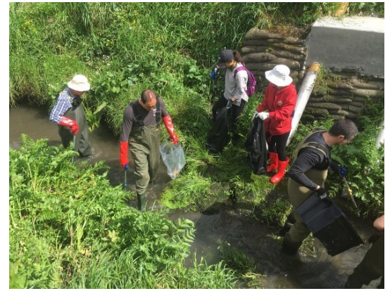
Kawau Stream Cleaning

The Multicultural Centre's daily English Conversation Sessions offers a good opportunity for people to meet, improve their communication skills, and ask questions in a relaxing and friendly atmosphere.