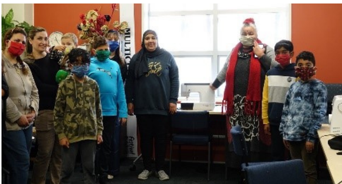
Face Mask Workshop

The MMC held a sports focused holiday programme at the Massey Recreation Centre. Young people enjoyed playing badminton, hockey, tennis, futsal, basketball, and football. The kids had a chance to tour the Sport and Rugby Institute building and tested their speed and endurance on the athletics track. It was a successful event, please look out for MMC next Sport Holiday programme.