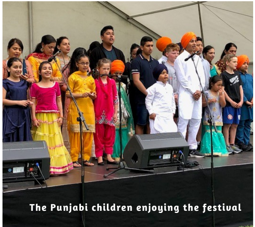
The Punjabi children enjoying the festival