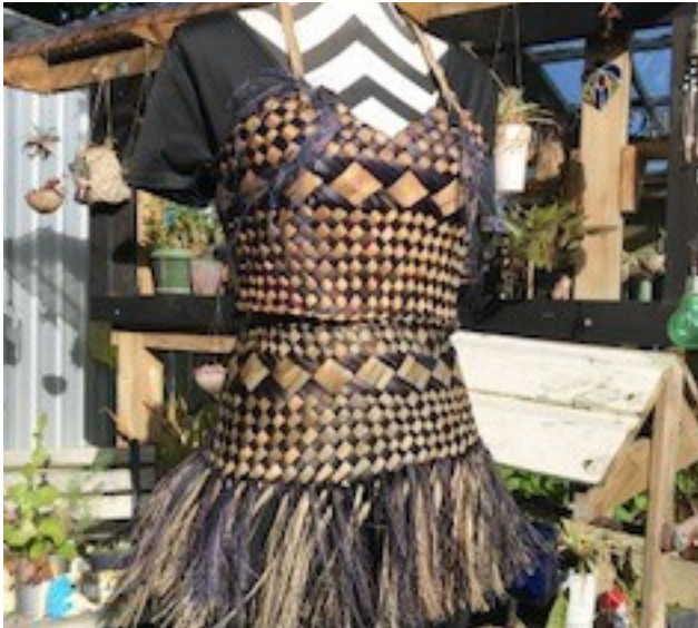
"Flaxy Bra" before the exhibition

The event was a fundraiser organized by the PN Heartland Lions, and all the proceeds goes to support the local breast cancer patients in the Manawatu.