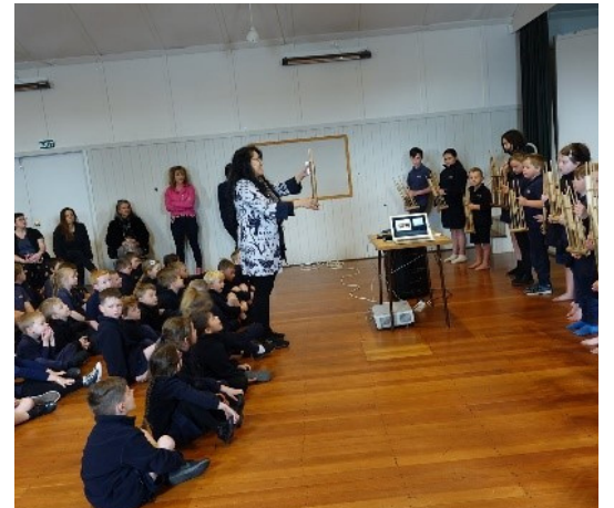
Taonui School Cultural Presentation