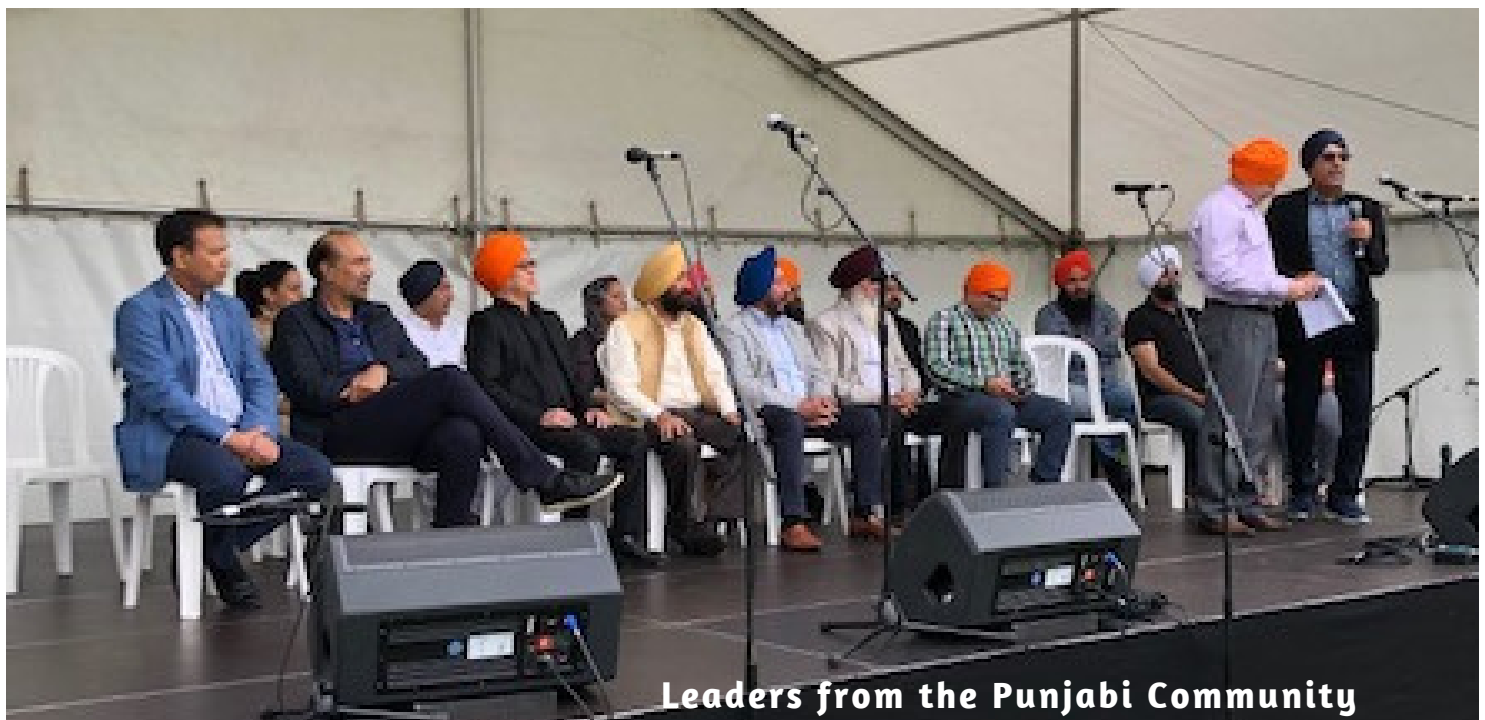
Leaders from the Punjabi Community