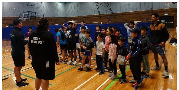
Sports Holiday Programme