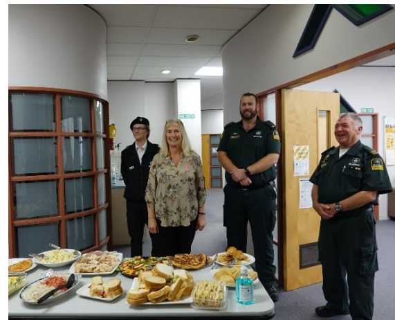
St. John Potluck Dinner