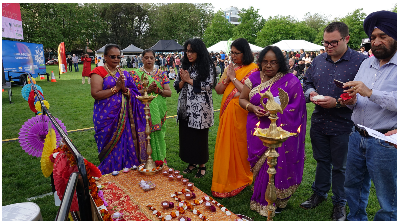
Snapshot taken at the Diwali Celebrations on Saturday 7th November