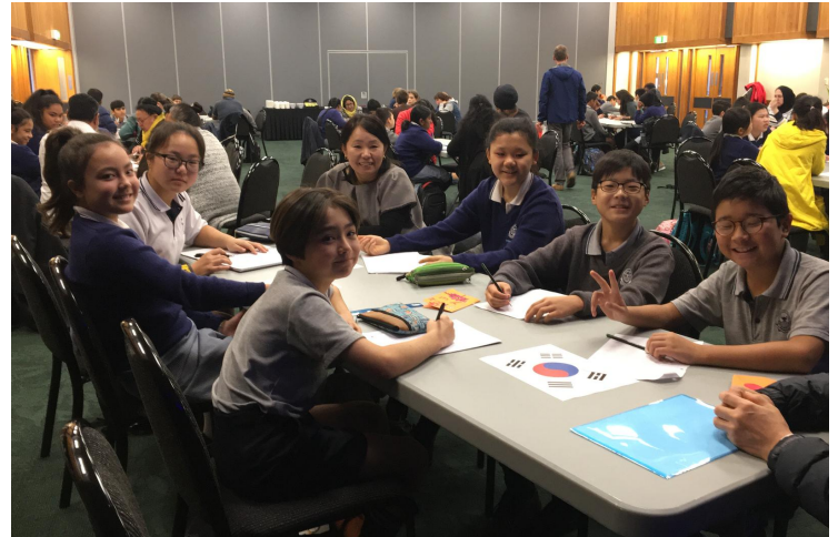
Some snapshots taken at the "First Voice Writing Workshop" Tuesday 23 June 2020