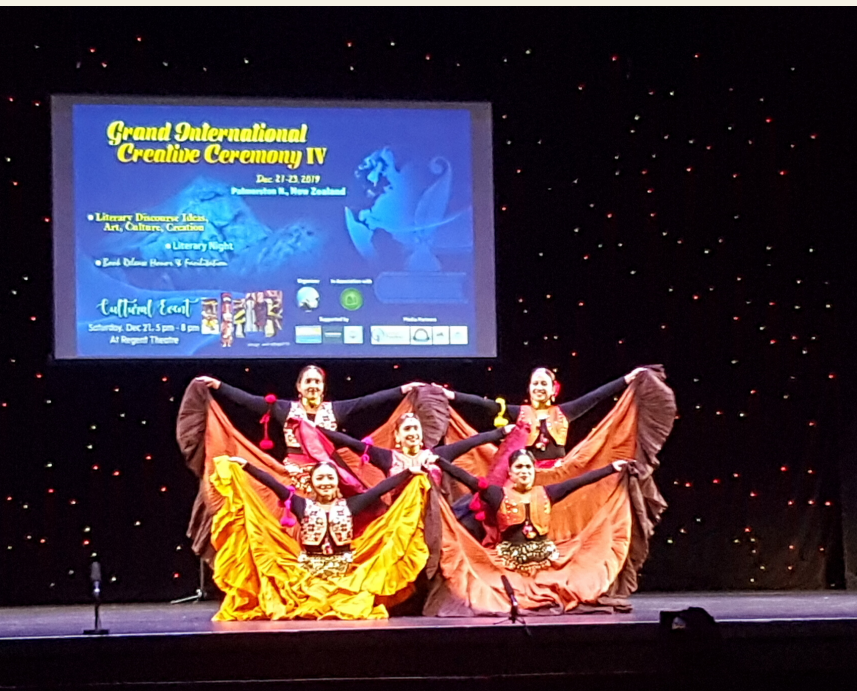
Amazing performance by Shree Dance Academy, Palmerston North during the event