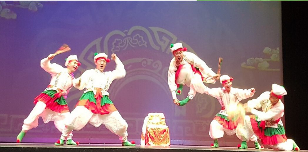
Award-winning 'Spring in Liyuan' Dance performed by Chongqing Liangjiang Art Troupe during the January 29 Happy Chinese New Year Show at the Regent Theatre