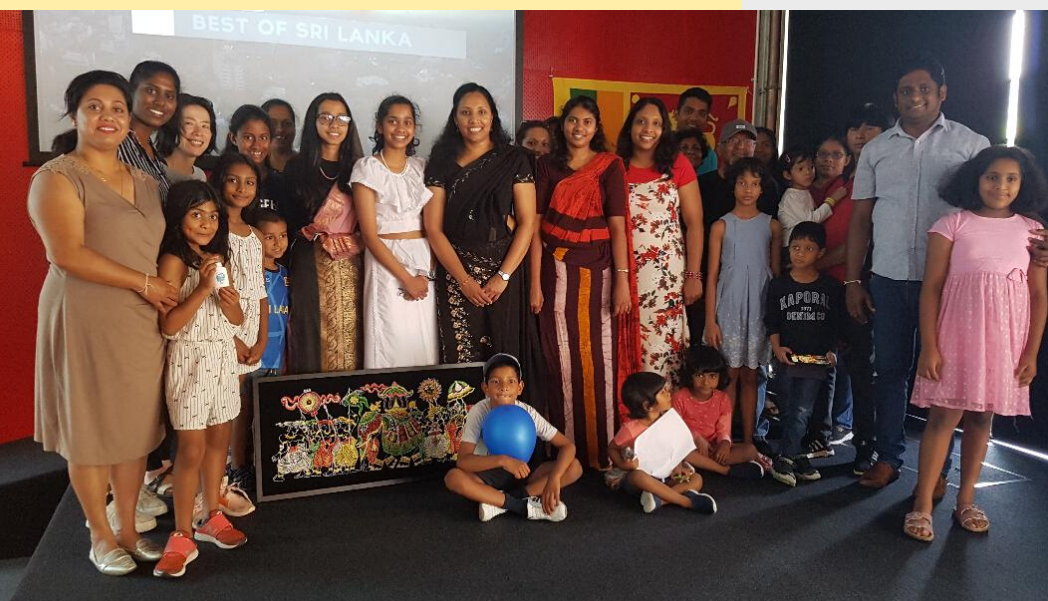
A cross section of Sri Lankan Community in Palmerston North during the celebration of their nation's 72nd Independence Day Anniversary on 1st February, 2020 at the City Library

There is a saying that "a cup of tea isn't merely a drink: it's the history of the world itself," so don't miss out on this unique session. The World Fair day, food, art and languages on 7 March will open officially with our cultural Costumes Parade. Our people will have a chance to march around the square dressed in their traditional costumes to open the festive day. If you would like to participate in the parade, get in touch with us immediately to book your spot. There are many more events and activities coming that we will be announcing through our Facebook page, newsletters and electronic communication. So, keep an eye out for more to come. We would also like to encourage you to share and promote your own events and activities with us too. Happy reading and best wishes for 2020.