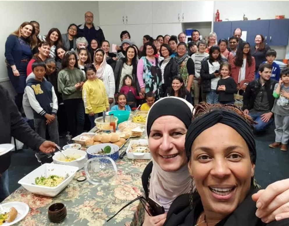
A snapshot from September's Potluck Dinner

We have maintained our potluck dinner for the past 9 years and counting. It is an initiative designed mainly to offer a welcoming atmosphere to new migrants coming into our City, but it has grown over the years and has recently become a regular function that we thrive to hold last Friday of every month. It is now a function that MMC uses to bring together migrants, international students, individuals and refugees regardless of how long they have been living in the City in a safe, welcoming and relaxed platform.