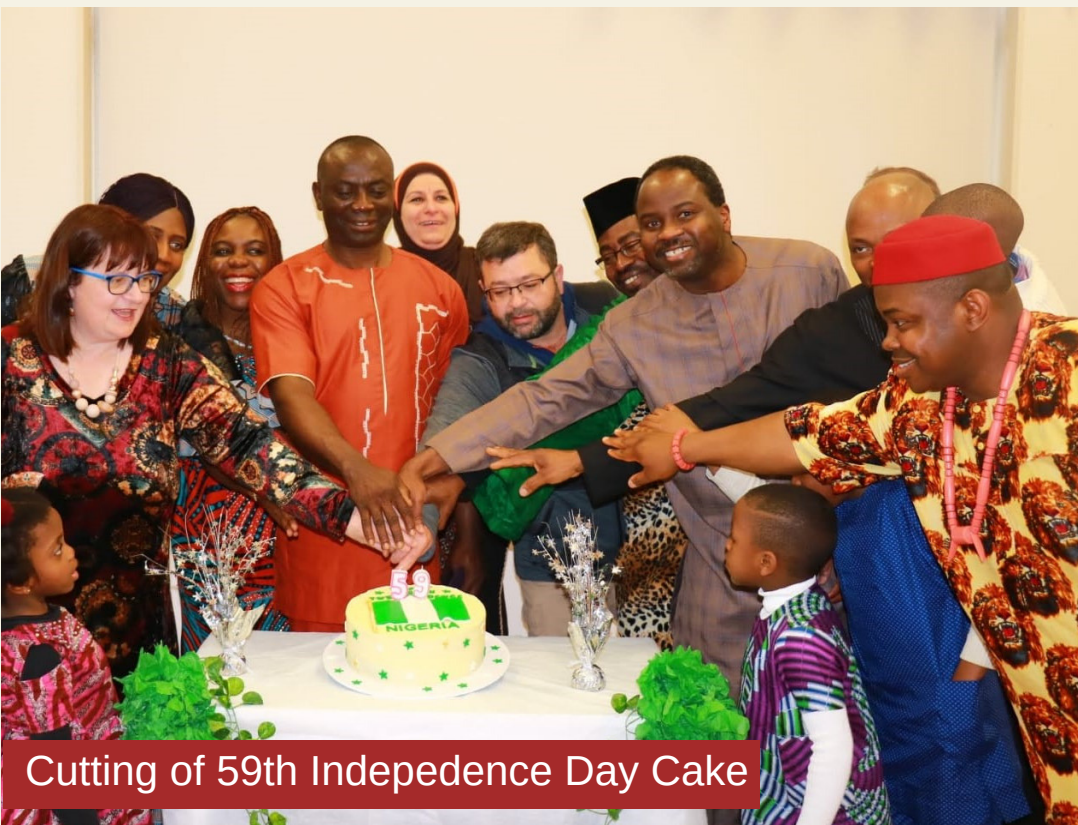
Cutting of 59th Independence Day Cake