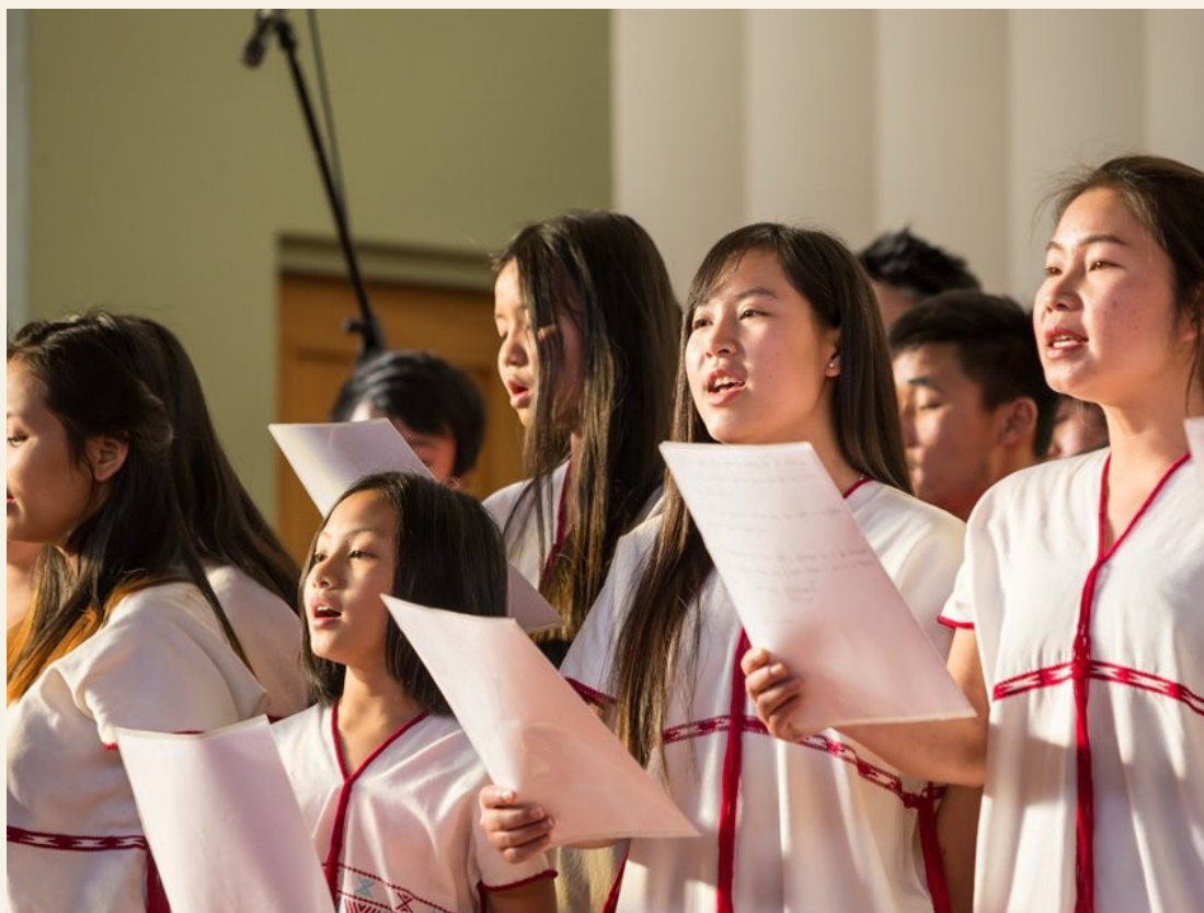
Karen Burmese Choir performing at the event

It was inspiring to listen and see talented members of our multicultural communities. Celebrating diversity is what MMC stands for and upholds. We support our ethnic communities all the way to be loud and proud. We appreciate all community groups who were committed to this event and passionate about participating to showcase their cultures before the wider community. Thanks to everyone who supported, participated and contributed to the success of the event. Special thanks to our sponsors and funders.