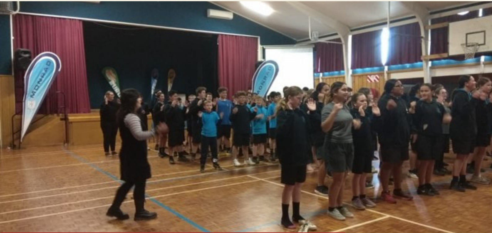
A cross-section of children at the assembly during the visit

On Friday 13 September our volunteers from Bhutan, Colombia, Kenya, Libya, Philippines and Pakistan visited Monrad Intermediate School to present facts about their countries/cultures. The presentations were aimed at bringing cultural awareness and respect among different cultures represented in Palmerston North.