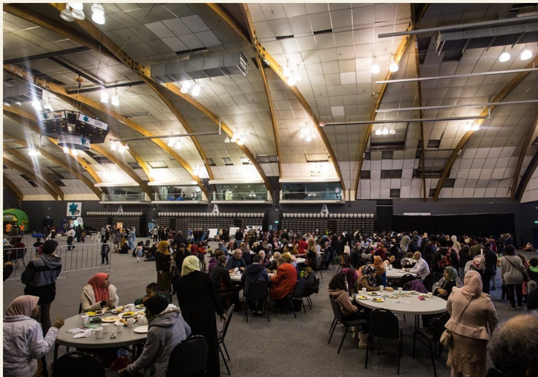
Attendees having lunch at the Eid Celebration