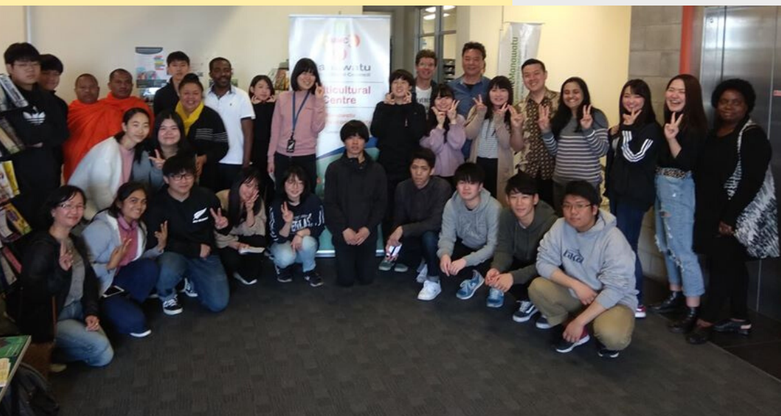
A cross section of IPU students, lecturers and MMC officials pose for photo during the visit

We would’ve never been able to deliver any of the above events and many more unlisted ones without the incredible support of our volunteers and so many people within the wider communities. Thank you for your commitment, trust and partnership. We look forward to continuing to make a difference with you in 2020. There will be new initiatives, more workshops and programmes. Follow us on Facebook. I can assure you that there will be something for everyone. Until then, I would love to take this opportunity to wish each one of you a very Merry Christmas. Have a happy, healthy and prosperous 2020!