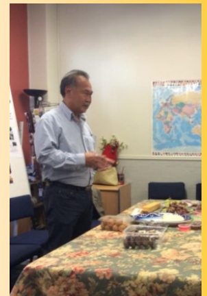
10 anniversary celebration for Manawatu Malaysian society