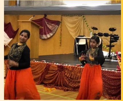
Local History Week at MMC