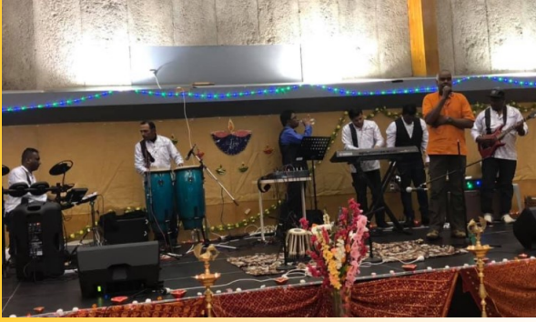
Diwali Celebration at IPU