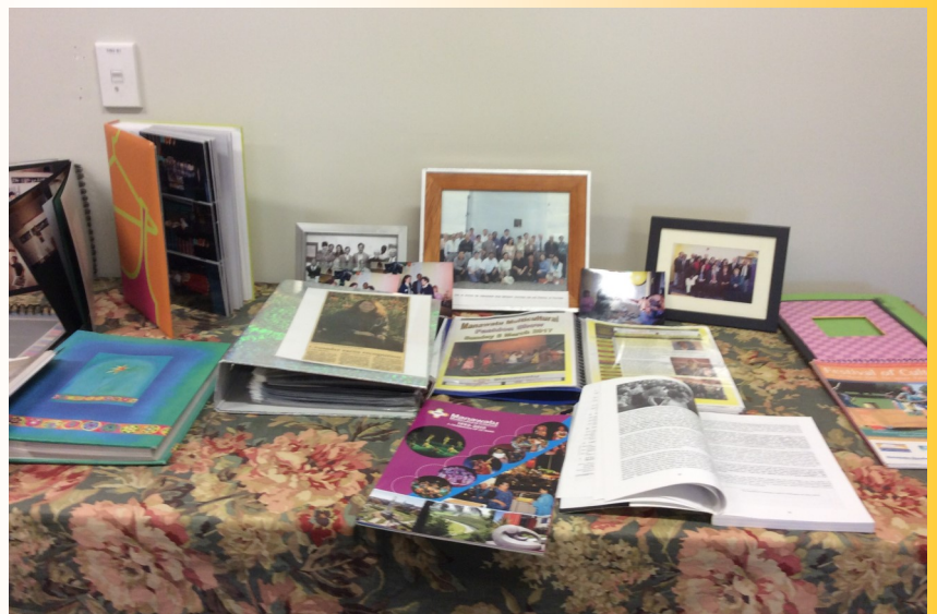
Table display of 25 years of MMC history