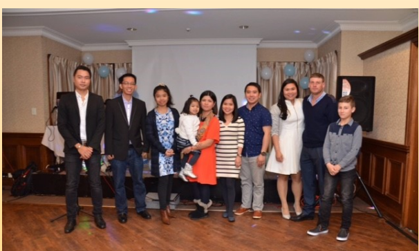
New Filipino arrivals to our city.