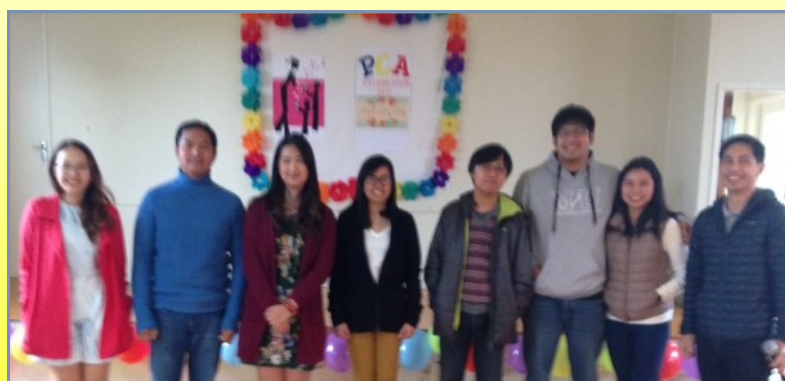
Philippine's Post Graduate Students