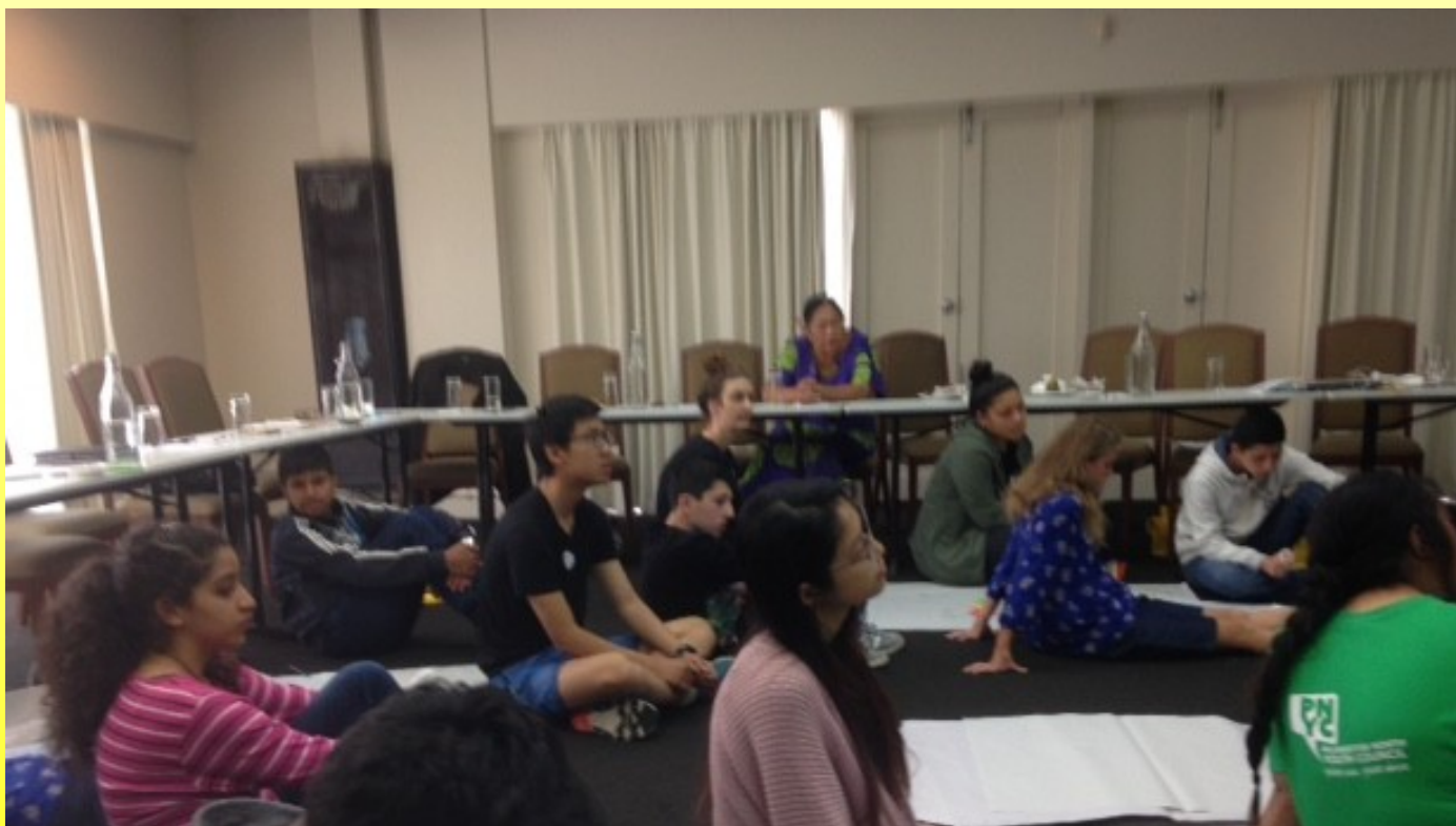
Youth Engagement Workshop on Saturday 11th March 2017 at the Copthorne Hotel