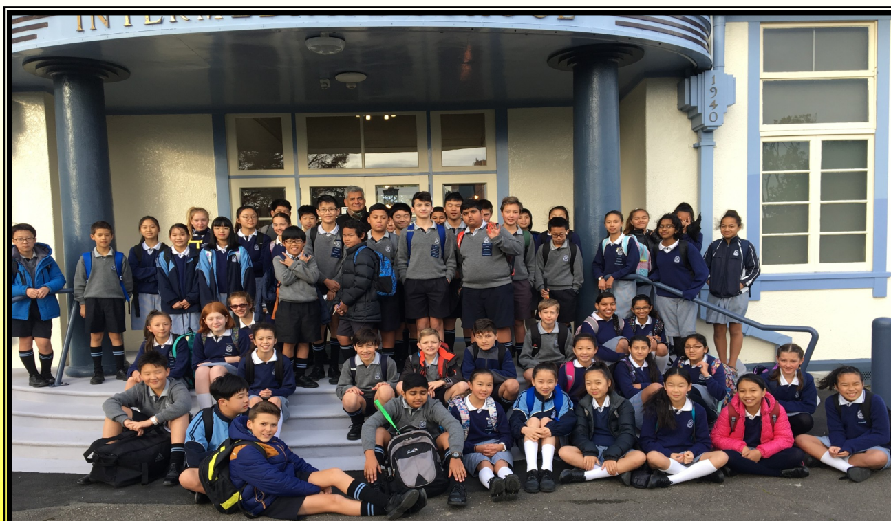
Palmerston North Intermediate Normal School—First Voice Writing Workshop May 23rd 2017