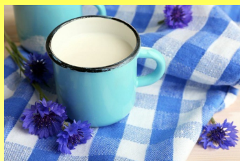
Low Fat Milk