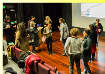
Photo's from June's event